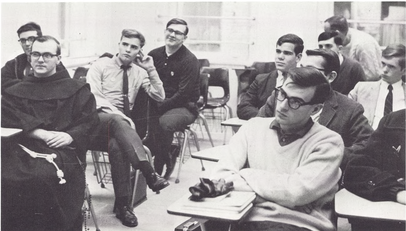
The Sociology Club meetings vary from week to week and may present topics and speakers from the many different fields that comprise the culture of today.

In the future, the Club hopes for closer cooperation with other organizations in the growing problems of the urban community.