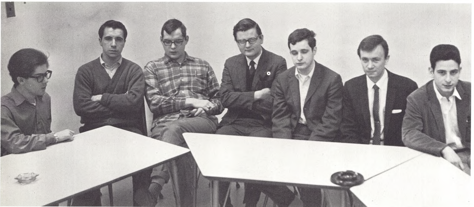
Philosophers ponder the existence of our photographer.