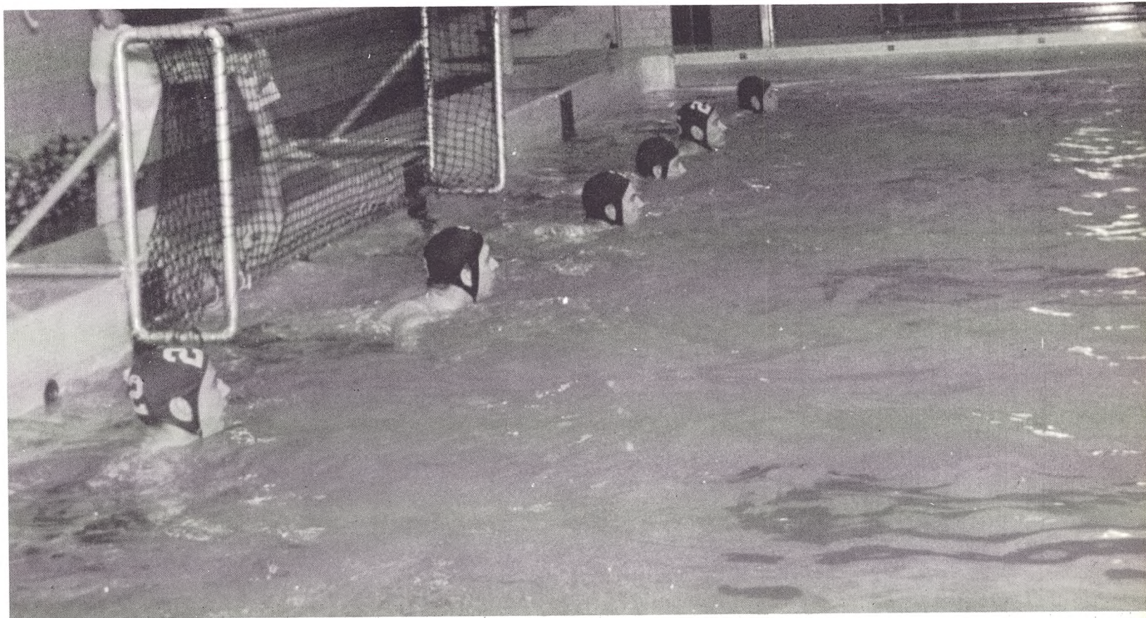
The calm before the storm.