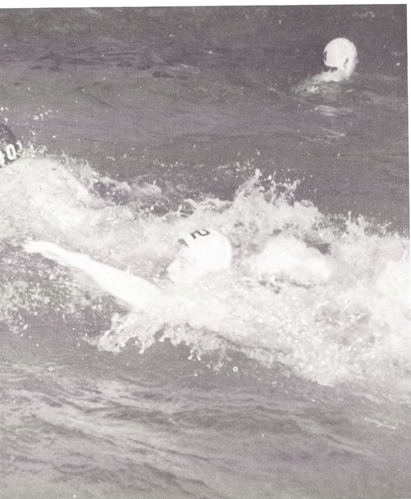
A cloud of dust and the beginnings of another St. Francis score.