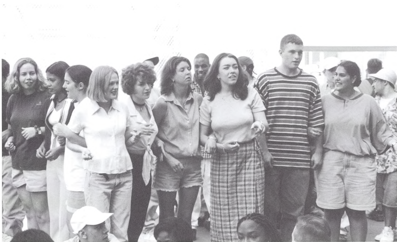
The Freshmen forced to do another humiliating activity, a requisite for Admission to the College!