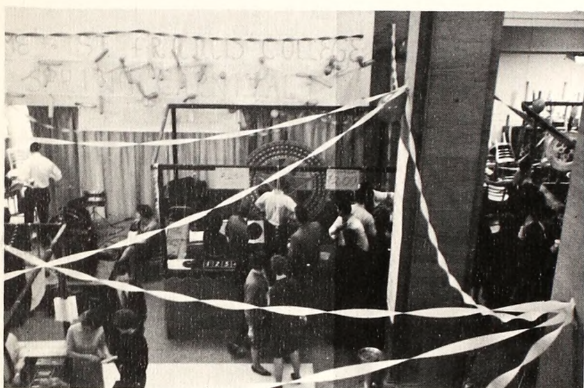
Another successful Carnival. Where was Joey Heatherton?