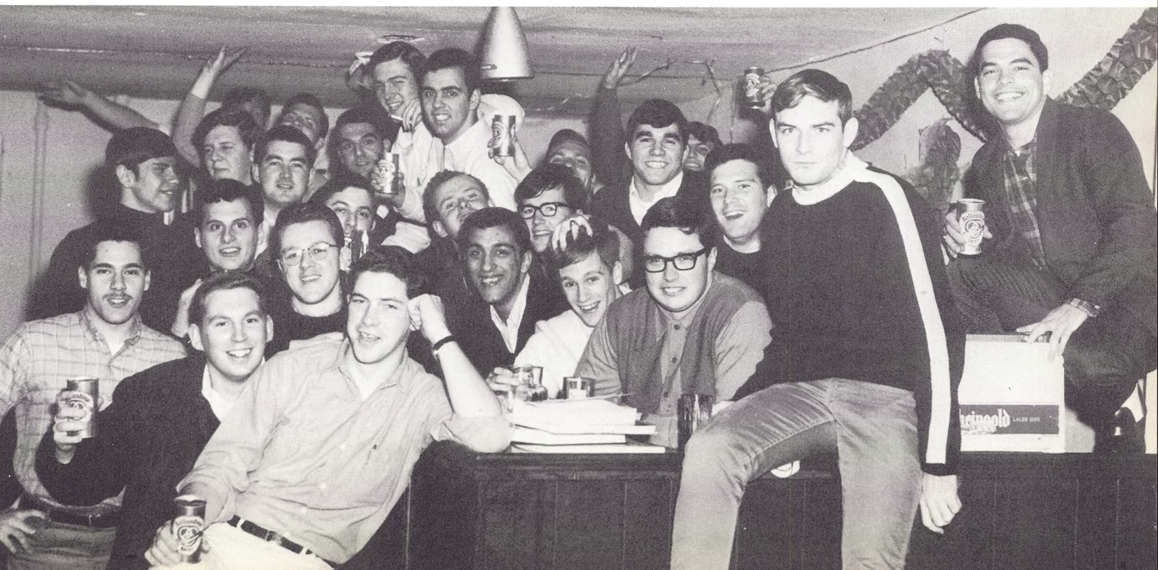
A leisurely ten minute break between classes.