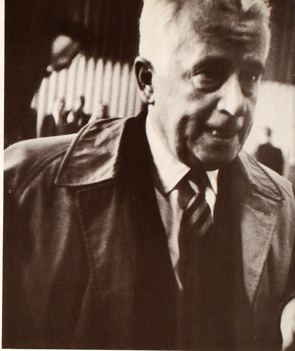
KENNETH KEATING, New York State Senator, addressed the College in September. Politics mixed with good "hoss sense" spurred the students to a standing ovation for the Senator.