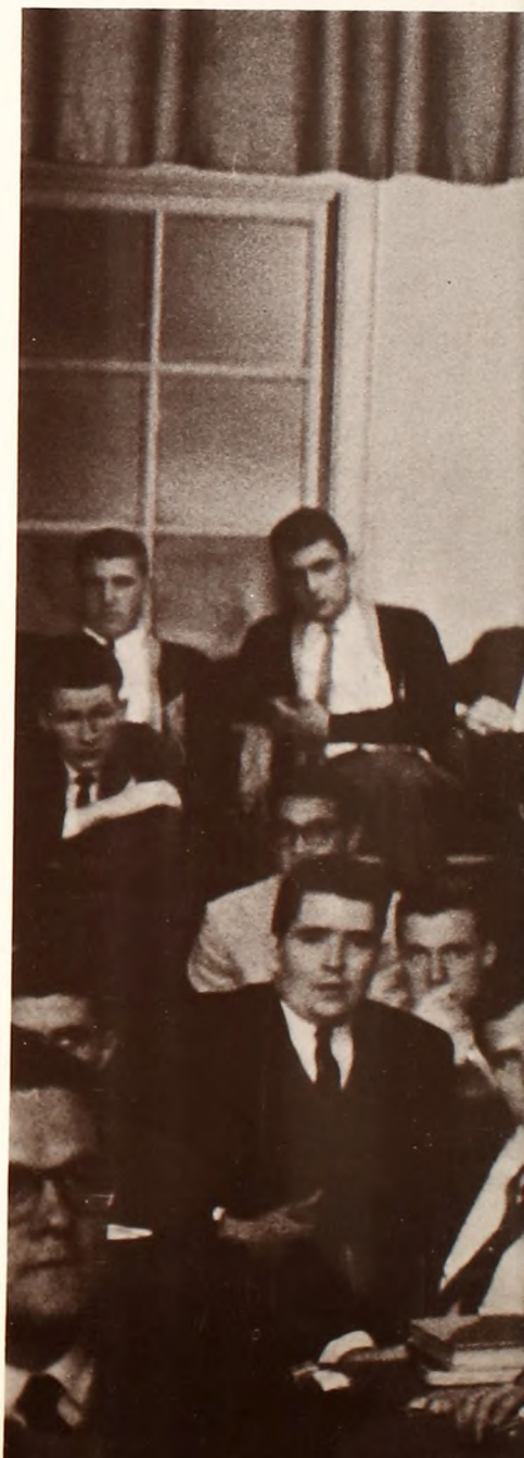
R. SARGENT SHRIVER, head of the Nation's Peace Corps, spoke at the faculty workshop. Shriver pointed to student leaders in a private college as prime material for Corps assignments.