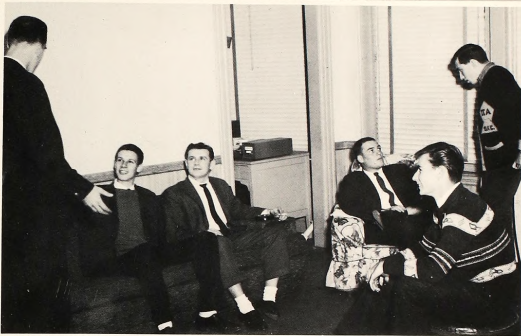
The new fraternity house offers a restful haven between classes. It also proves to be a means of bringing all the men of Pi Alpha closer together.