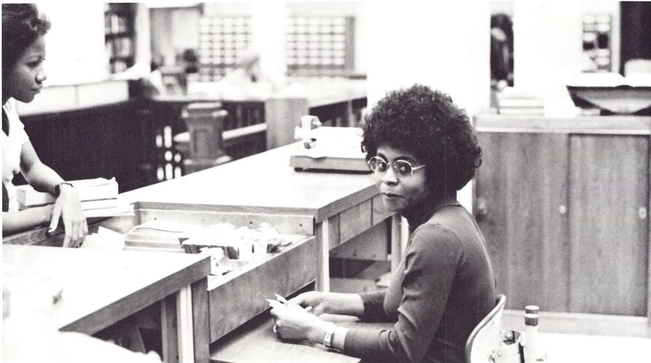
I got my job through the VOICE.