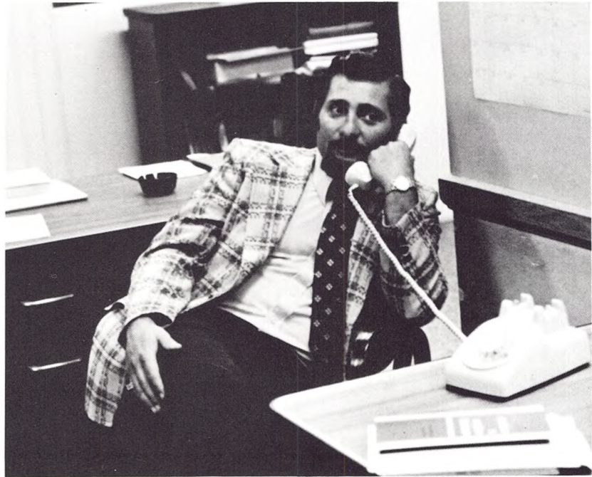
That's right, two pepperoni pizzas and a Tab.