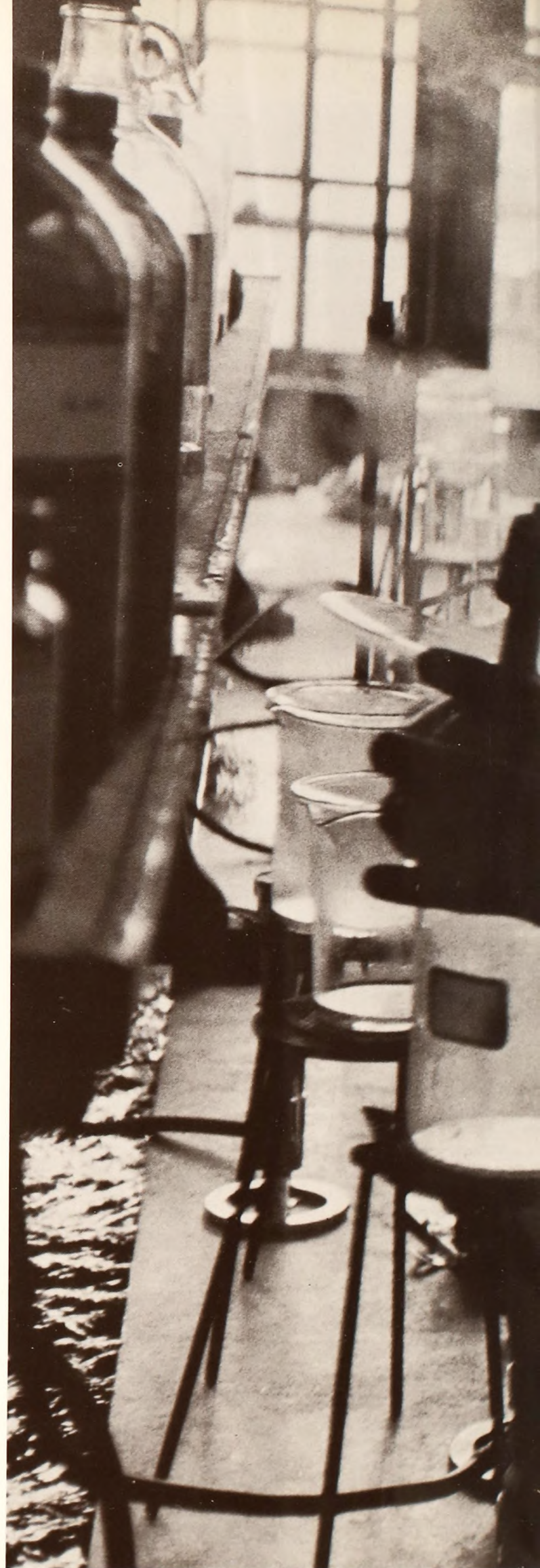
FRANK RUSSO-ALESSI applies trig theory to surveying transit in determining elevation angle of College building.