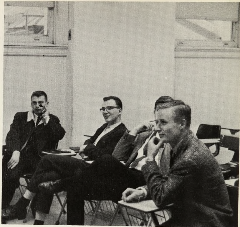
Sneaking a spyful look at the Rifle Club at one of their informal meetings.

Much like the Rifle Team, the Rifle Club of the College saw a tremendous increase in membership numbers and interest. Instruction on the use of guns and their care was provided at many of the club's meetings this year. With the help of members from past years an active interest in guns and their proper use was actively fostered among club members.