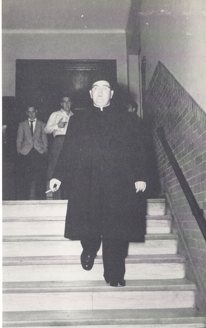
"Final marks? . . . No comment."