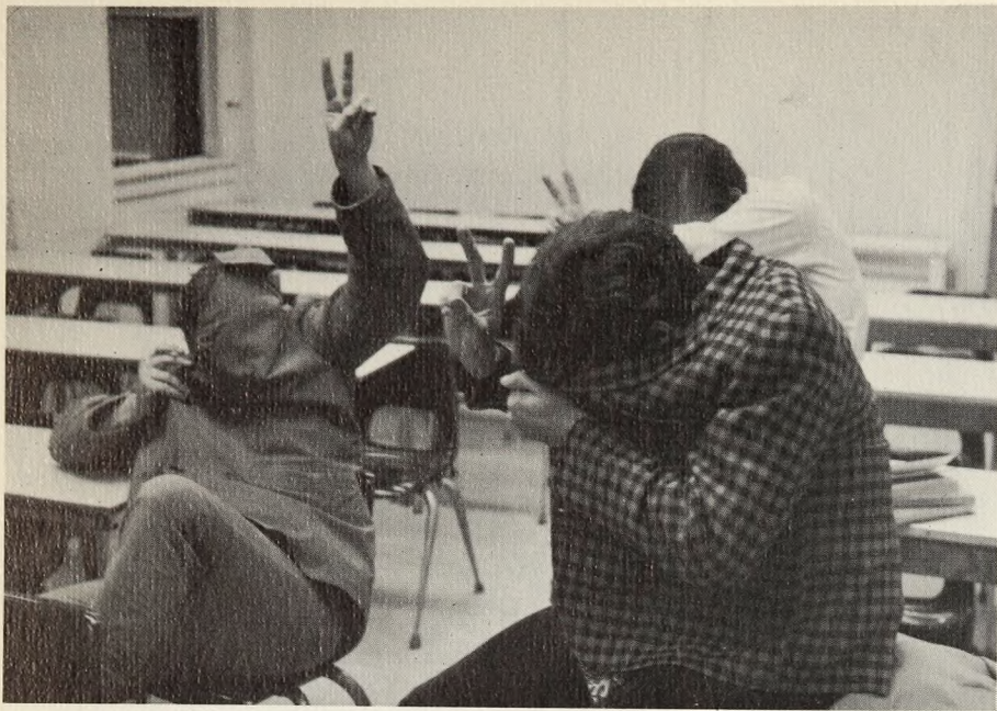
The Peace Fellowship spoke out