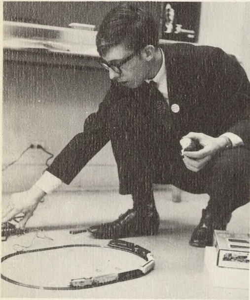
Insanity began to creep in