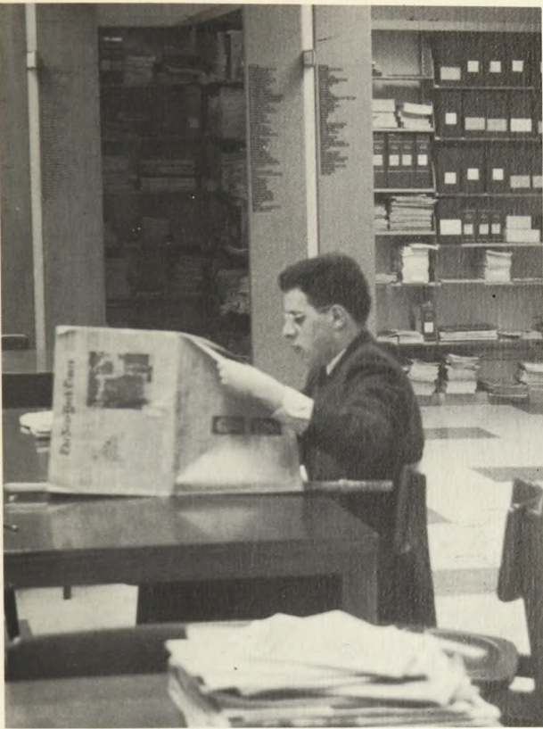
Good use was made of the library