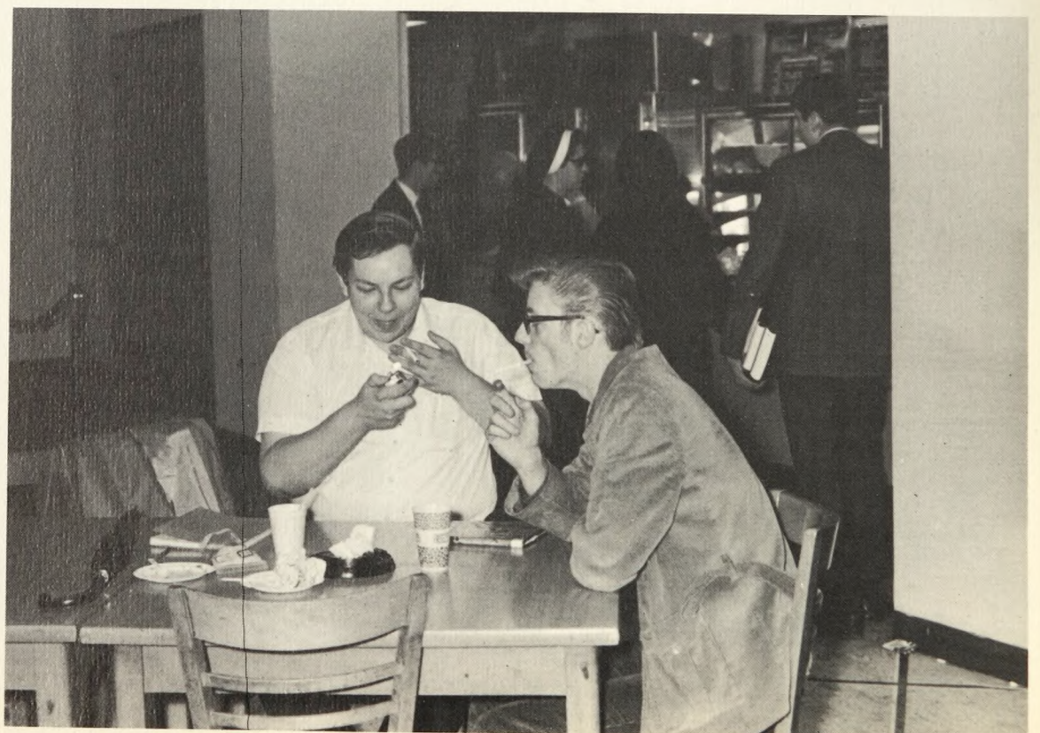
A serious discussion of the Tibetan Book of the Dead