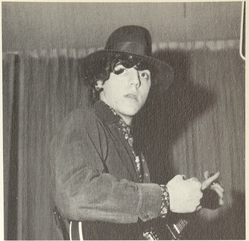
A member of the class of '72