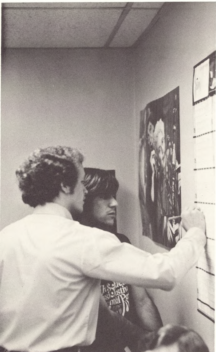
"Are you free the 29th?"

innovations as Party in the Park. This Saint Francis College first allowed the students and faculty alike, to partake in an enjoyable afternoon get-together this fall at Belmont Lake State Park. Other school functions which served to unify the student body were several weekend mixers held in the cafeteria, and well appreciated popular movies shown in Founder's Hall. Other events sponsored were the traditional Soph-Frosh Ball and Senior Prom, new additions to the game room, and the opening of the new sun roof.