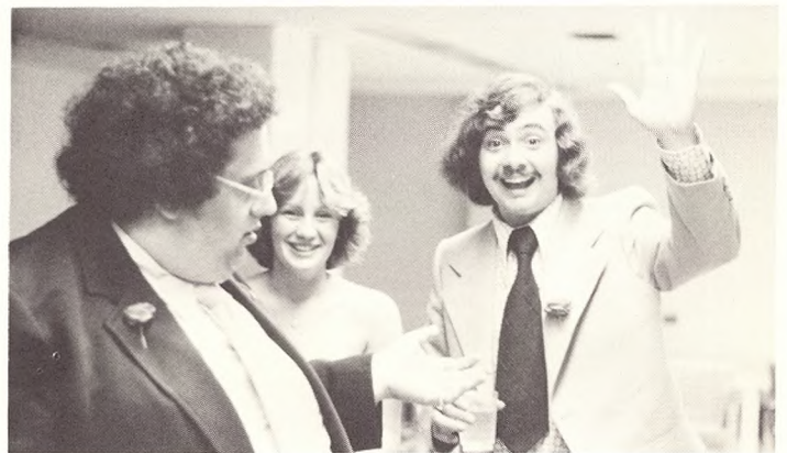
"Hi, Mom! Hi, Dad!"