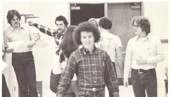
(Nash blows it again)