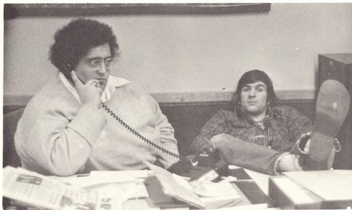
"Is this any way to run a government?"