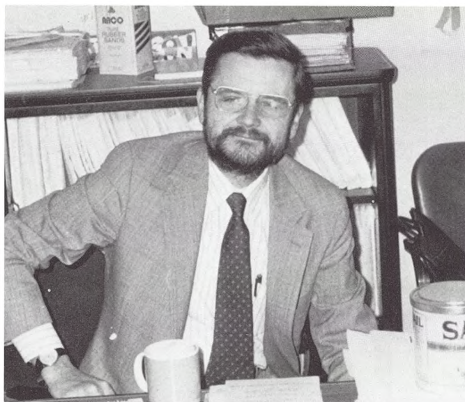
"Take the picture, my smile is frozen!"