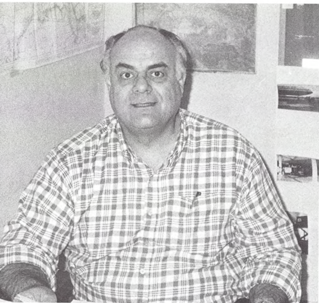
"No, we don't sell that here."