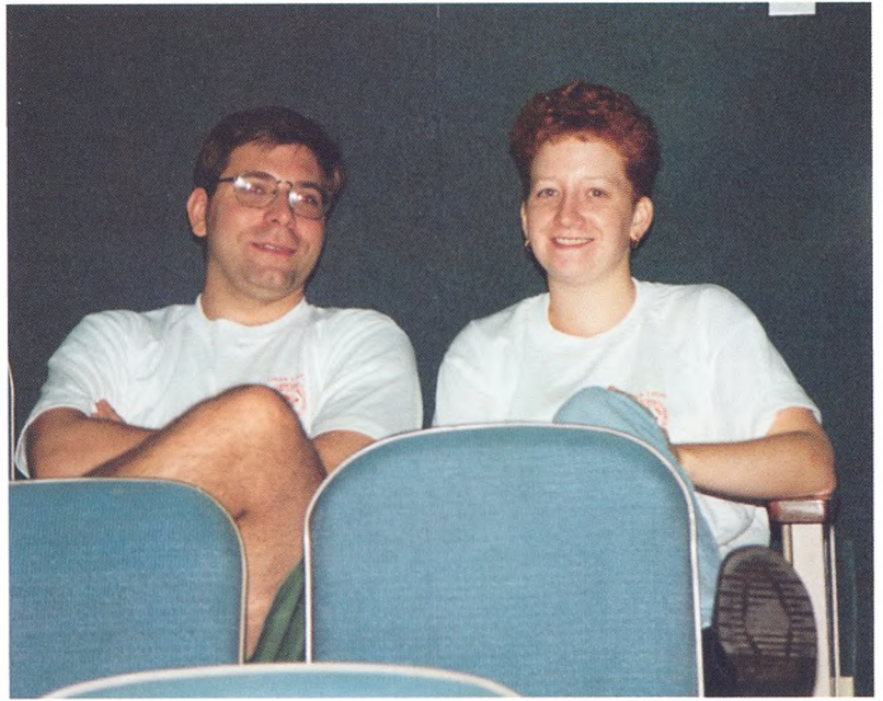
left photo- So you're saying if I take this class- I'll be graduating when?