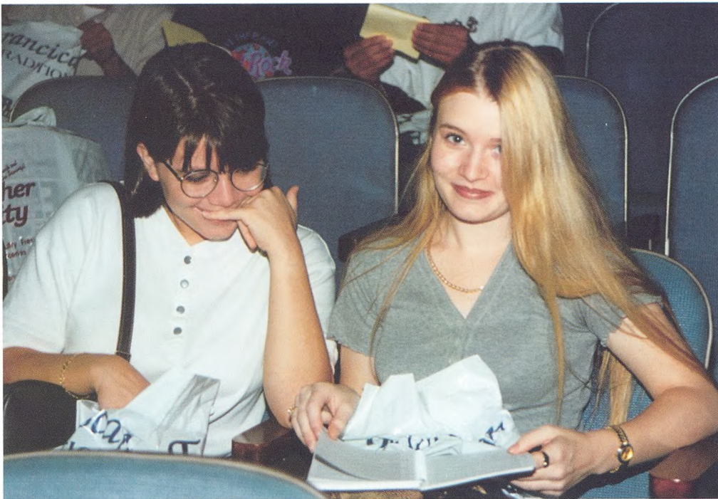
Oh my God! They're taking our picture- Do they know we're freshmen? Does it say it all over our faces?