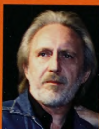
John Entwistle 1944-2002