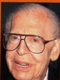
Milton Berle 1908-2002