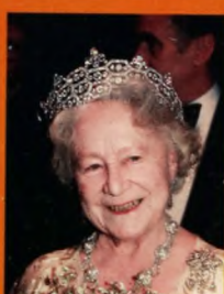
Queen Mother 1900-2002