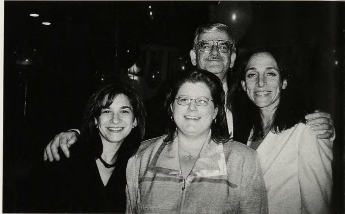
- Organizers of the yearly Community Day