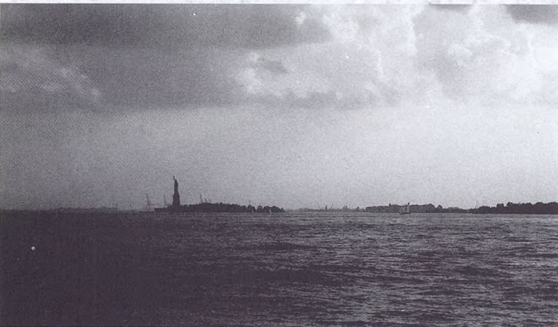
The Statue of Liberty greeting travelers from her Ellis Island