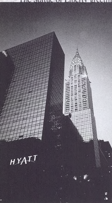
The imposing Crysler Building