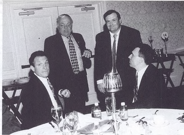
The question is: Basketball or Political Science?