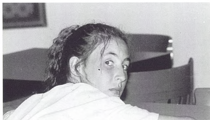
Hey Guys, Leave me alone I need my beauty sleep