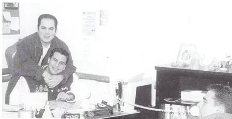
Look Hooked on Phonics Worked for us