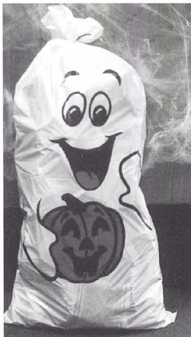
Honor Roll Student