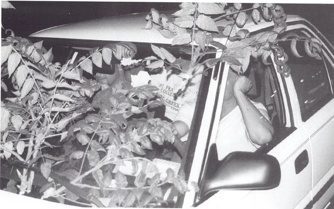
Driving past St. Francis can be an adventure