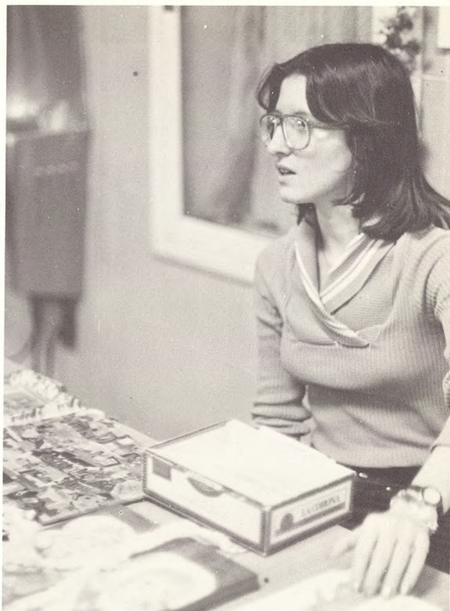
8. (thirty-five points)