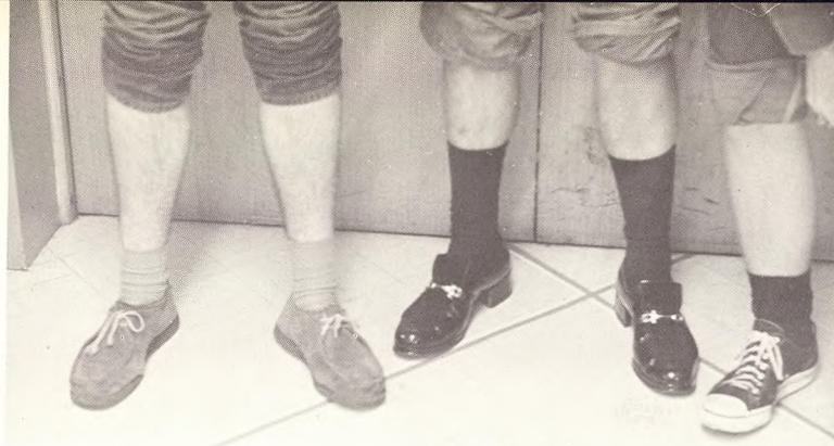
6. (twenty points)