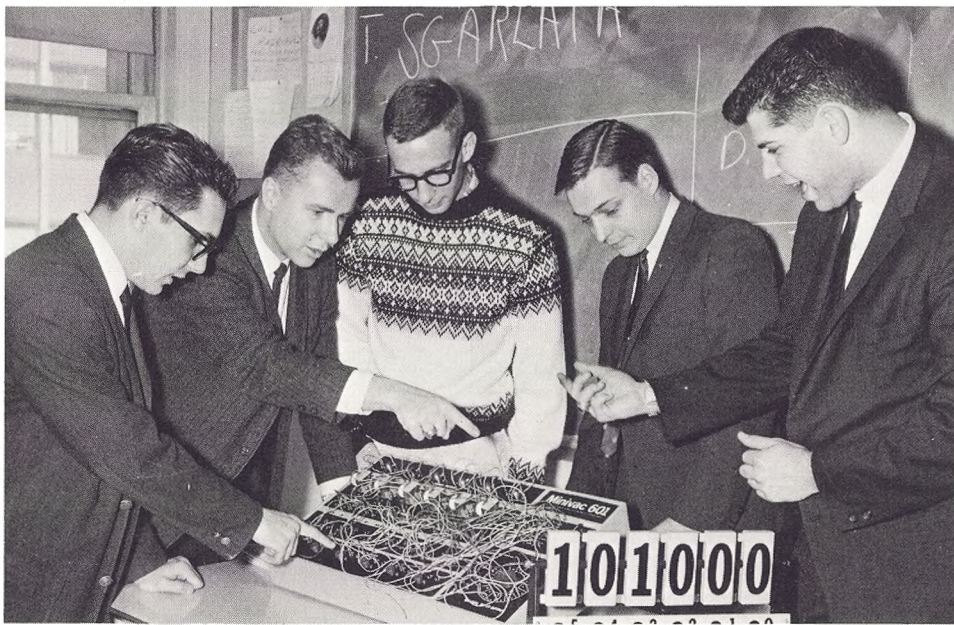
Club members discuss new equipment.