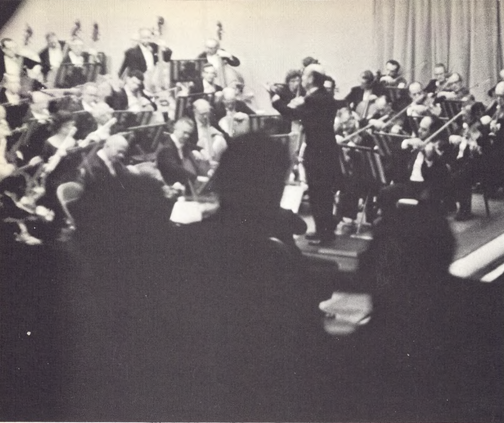
Club members watch the Boston Symphony Orchestra at the Brooklyn Academy of Music.