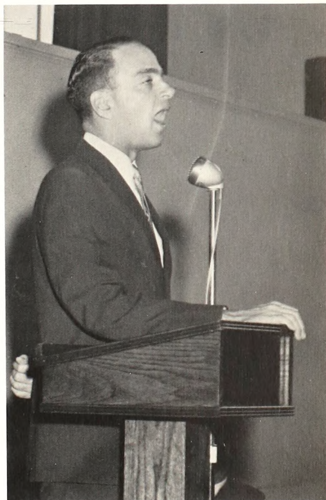
SOUNDING OFF on a topic of national concern, Roy Cohn, well-known attorney who became a national figure during the McCarthy Senate Hearings, addresses the student body. Mr. Cohn gave a brief but pithy talk and devoted most of his time to answering questions.

THE BIGGEST STORY OF THE YEAR, so big that it will soon become a major cycle of its own, was the purchase by St. Francis of five new buildings on Remsen Street in Downtown Brooklyn from the Brooklyn Union Gas Company. Within a few years, these buildings will house all the Business and Liberal Arts classes, the Administrative offices and the student facilities of St. Francis, while the Butler Street location will be devoted exclusively to Science. The first major step in the Expansion Program, this purchase will allow for increasing diameter in the cycles of St. Francis.