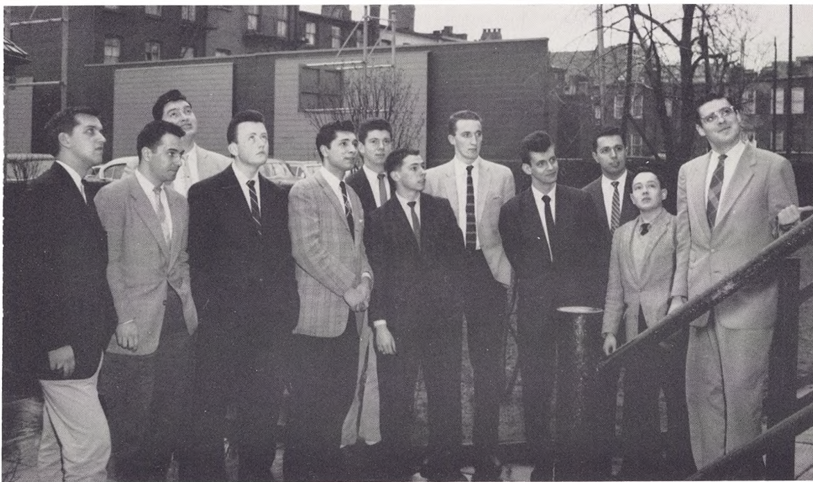
Irish eyes are smiling.