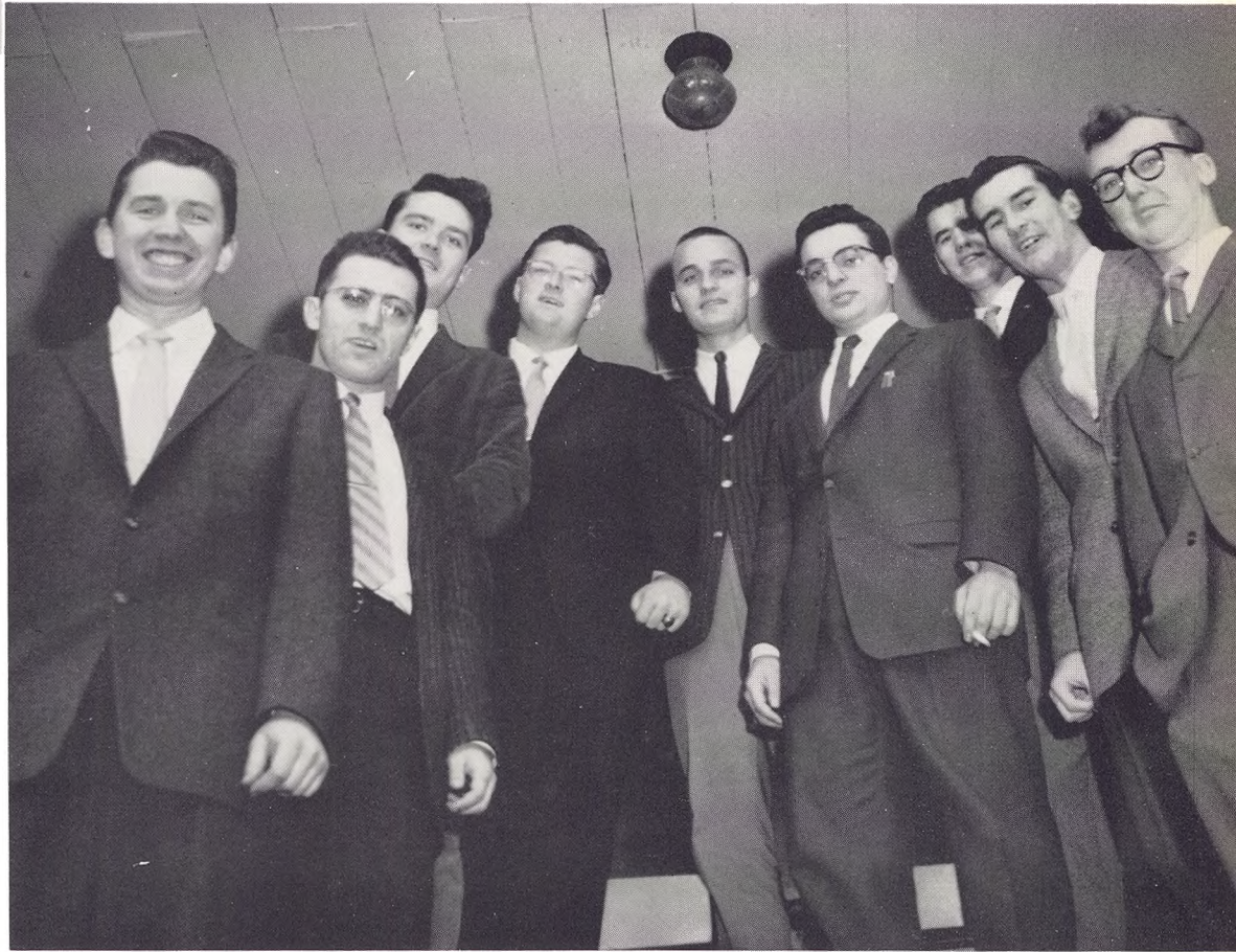
Philosophers take time out from their meeting to pose for an informal picture.