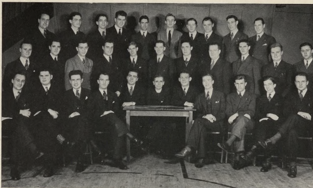
To Kalon K'Agathon