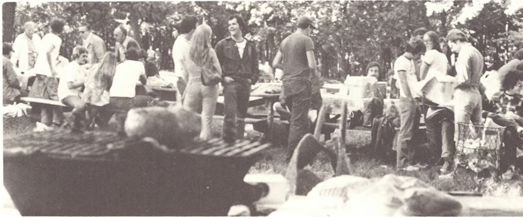
The 3rd District, which includes all metropolitan Chapters, enjoys a party in the park.