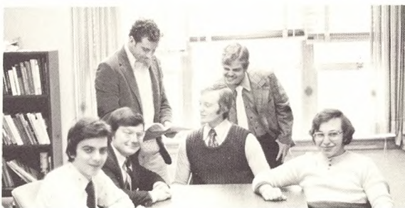
Watch out business world!