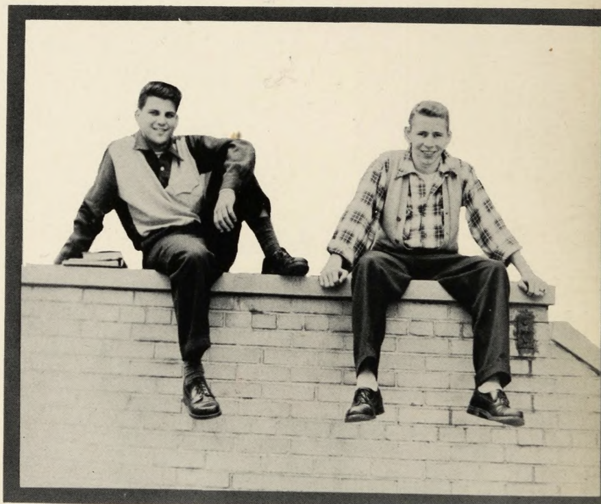
Two bumps on a log???

We also had the good fortune to have several members of the class make the varsity squads in both basketball and baseball. As in past years the sophomore class was behind each activity that took place in the school.