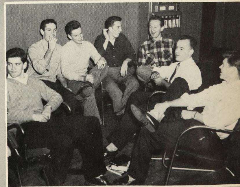
Informal class discussion???