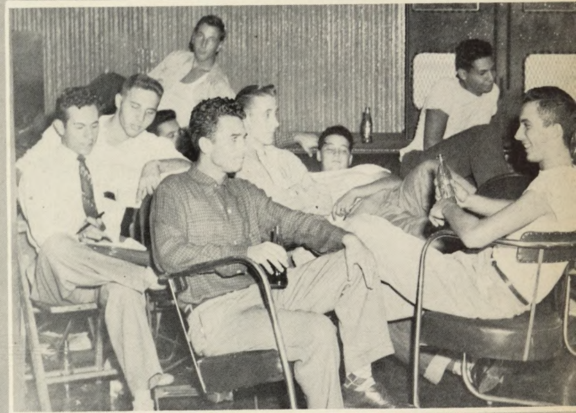
The pause that doesn't help a thing.