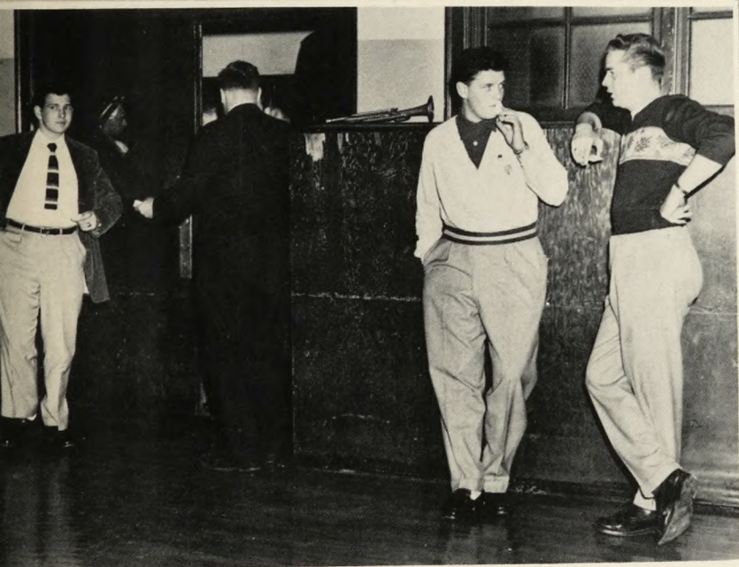
"You know who the guest speaker is today?"