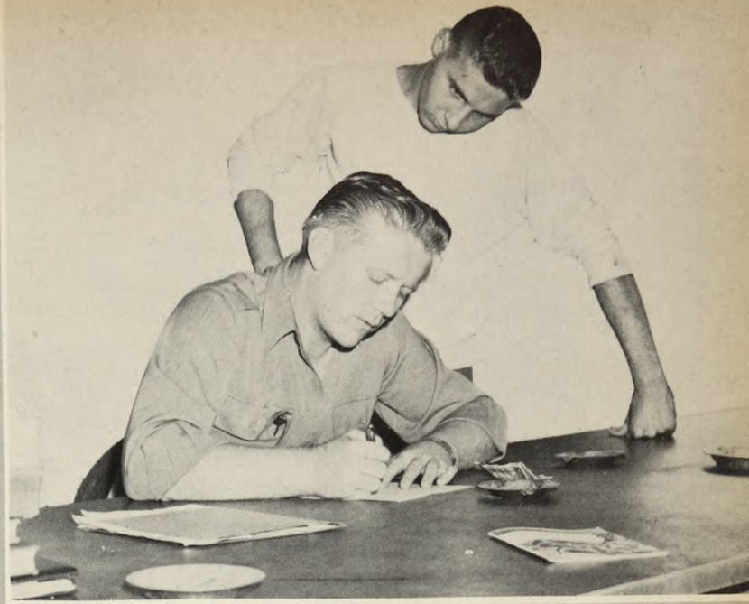
"If we get all the Freshmen to go . . ."