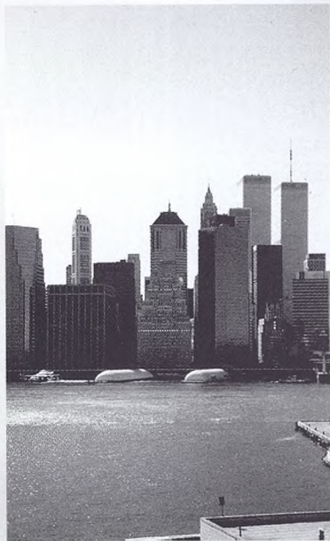
View of our famous New York skyline in June '01