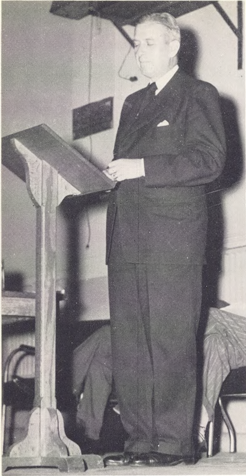
Myles McDonald, Kings County District Attorney, giving the Democratic side of the argument in a pre-election forum.