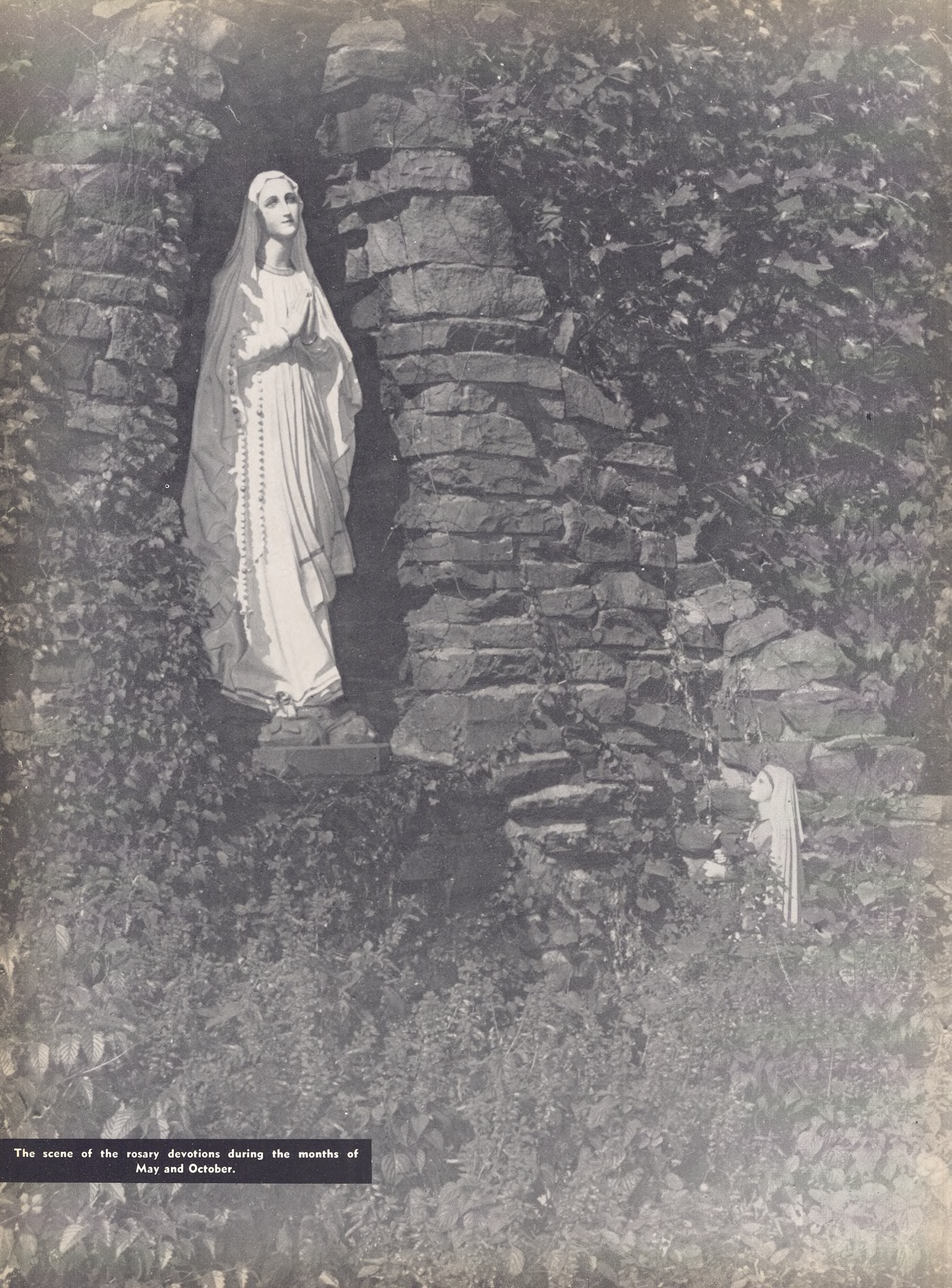
The scene of the rosary devotions during the months of May and October.