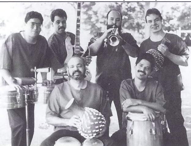
Musicians from renowned Latin bands at Salsa Festival at SFC, Oct. 27