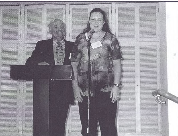
Annual Endowed Scholar Reception, Sept. 12.