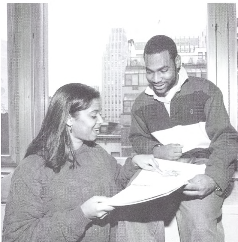
OK one more time- A is for Apple & B is for ...