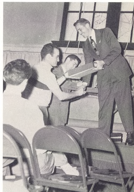
Well earned reward.

"Old St. John's" ain't what she used to be.