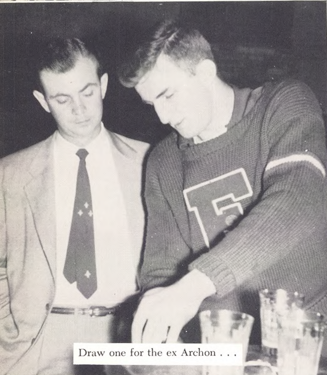
Draw one for the ex Archon . . .