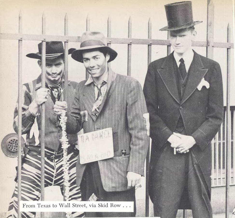
From Texas to Wall Street, via Skid Row . . .