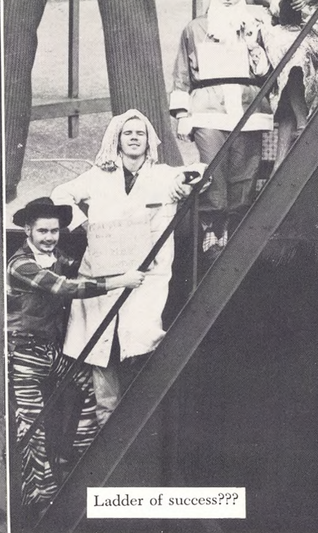
Ladder of success???