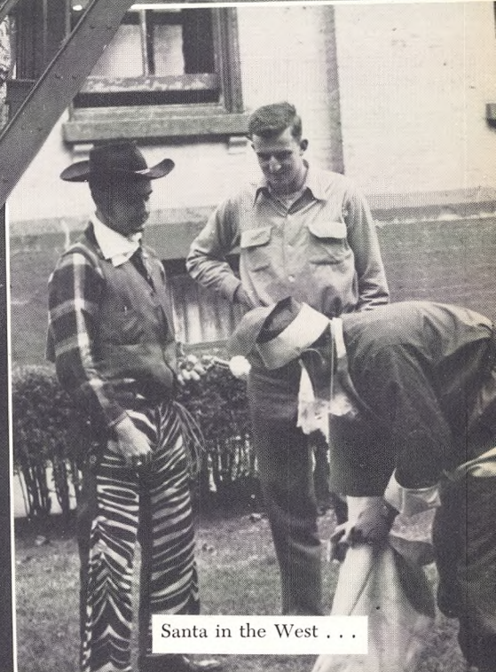
Santa in the West . . .