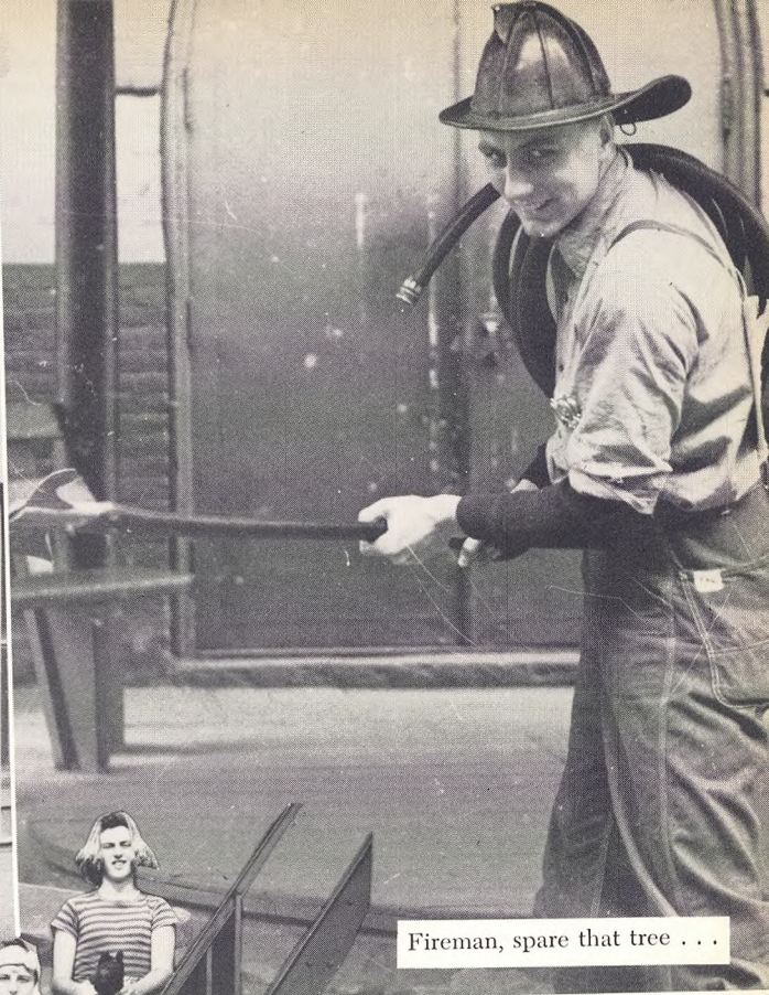
Fireman, spare that tree . . .