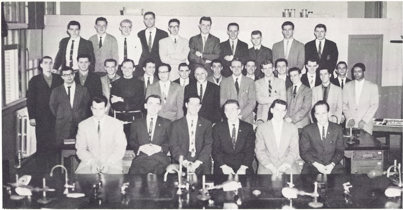
Club members gather with members of the Science Department.