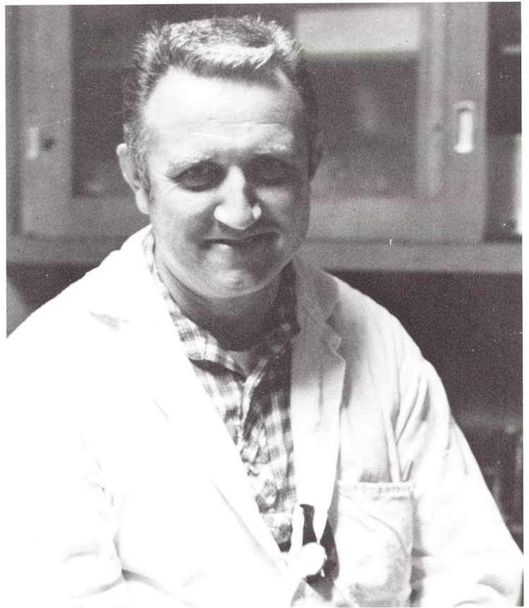
Director of Disneyland