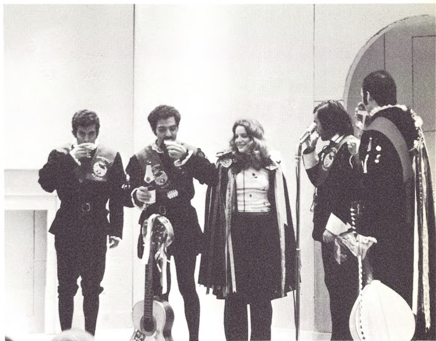
La Tuna toasts their hosts and celebrates later with Spanish delicacies and vino.