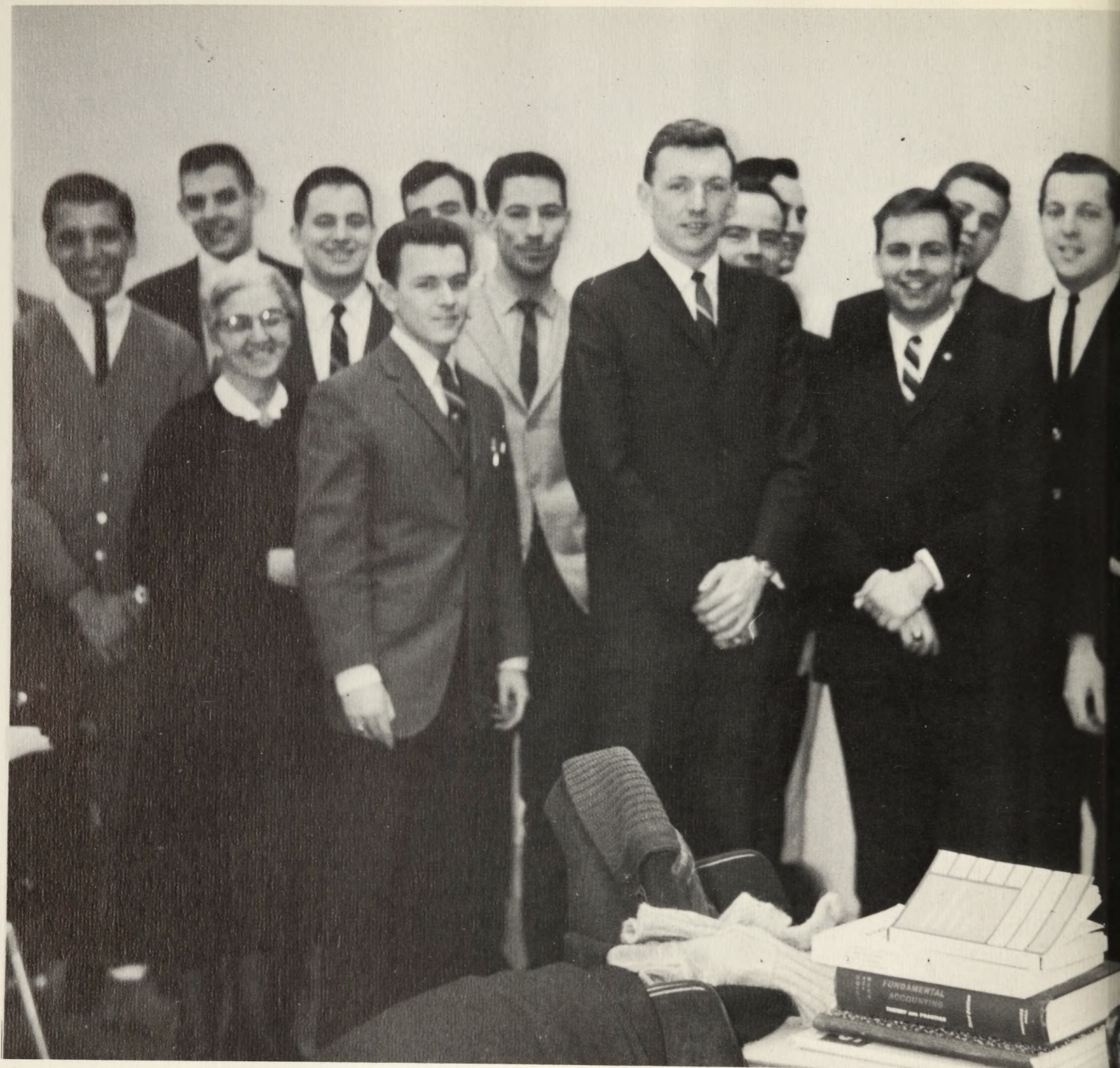
Club officers and members take time out to pose for our photographer.