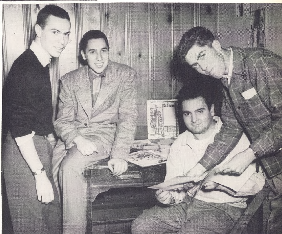
The Big Four.