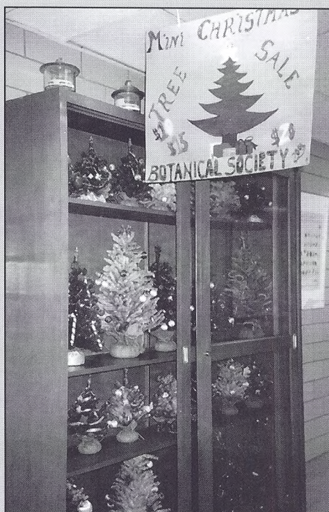
Christmas Tree Sale at SFC

The Botanical Society also organized field trips to the Brooklyn Botanic Garden and Pfizer Manufacturing Company.