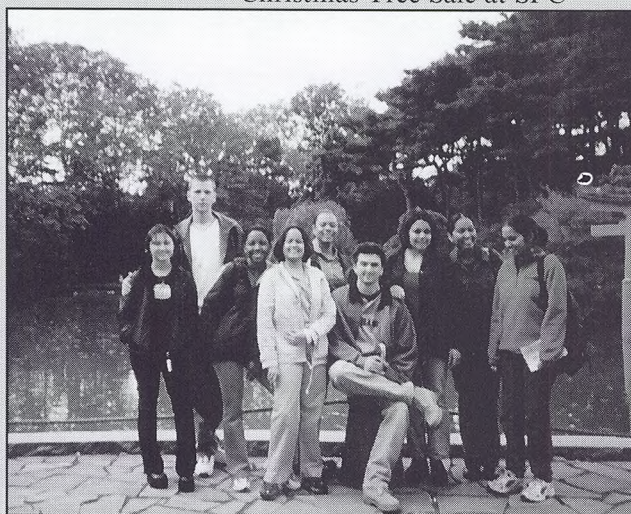
Trip to Brooklyn Botanic Garden