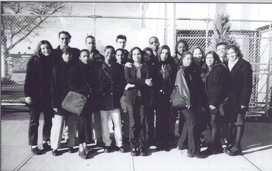
Left: Botanical Society, Pfizer Manufacturing Company Tour Nov. 7, 2000

For the past academic year the Botanical Society has taken part in a number of events which were geared towards the refurbishment of the greenhouse. The Botanical Society also raised funds towards charity and organized activities to enhance the academic growth of our members especially in the area of Science.