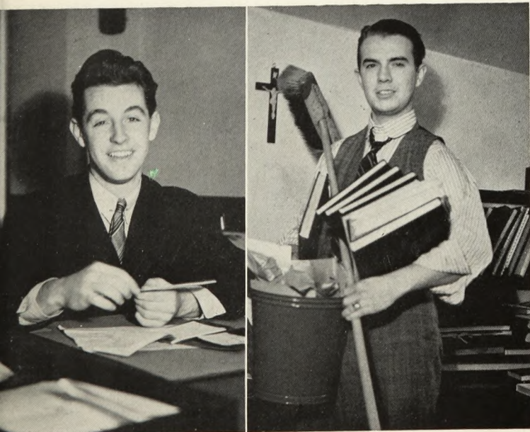
Left: The Dean says "yes." Right: All this, and Editor too.

Religion Club; History Club 3, Treas. 4; German Club 1, 2; Arts Club 4; Chairman Soph-Frosh Dance; The Troupers 1; Co-Chairman Junior Prom; Franciscan , Editor-in-Chief.