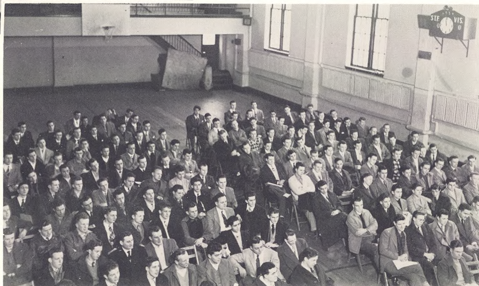
Classes instead of ball games.

Overall, it was the biggest event in this College year, St. Francis was launched successfully into big time ball.