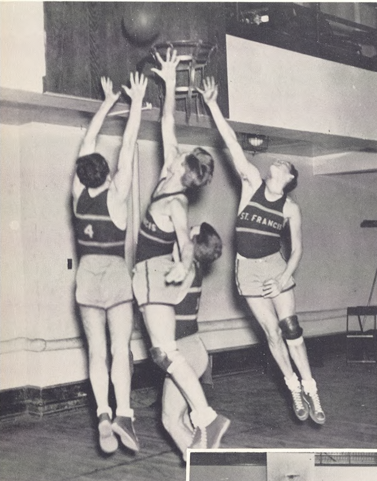
Shooting in the College crackerbox.