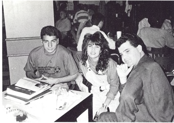
"Really, we have no class!!"