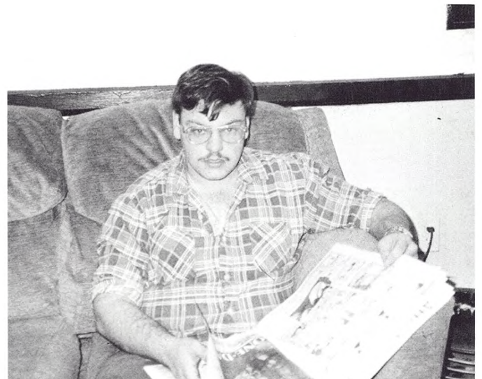
"The morning after the night before!"