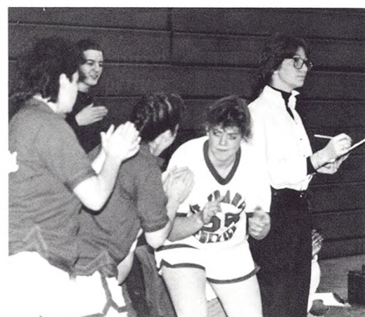
"Which way did he go???"