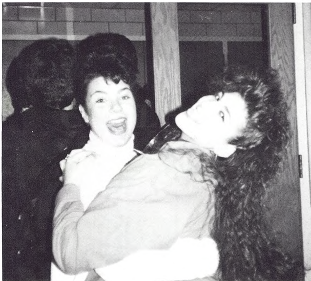
"One, two cha cha cha!!"