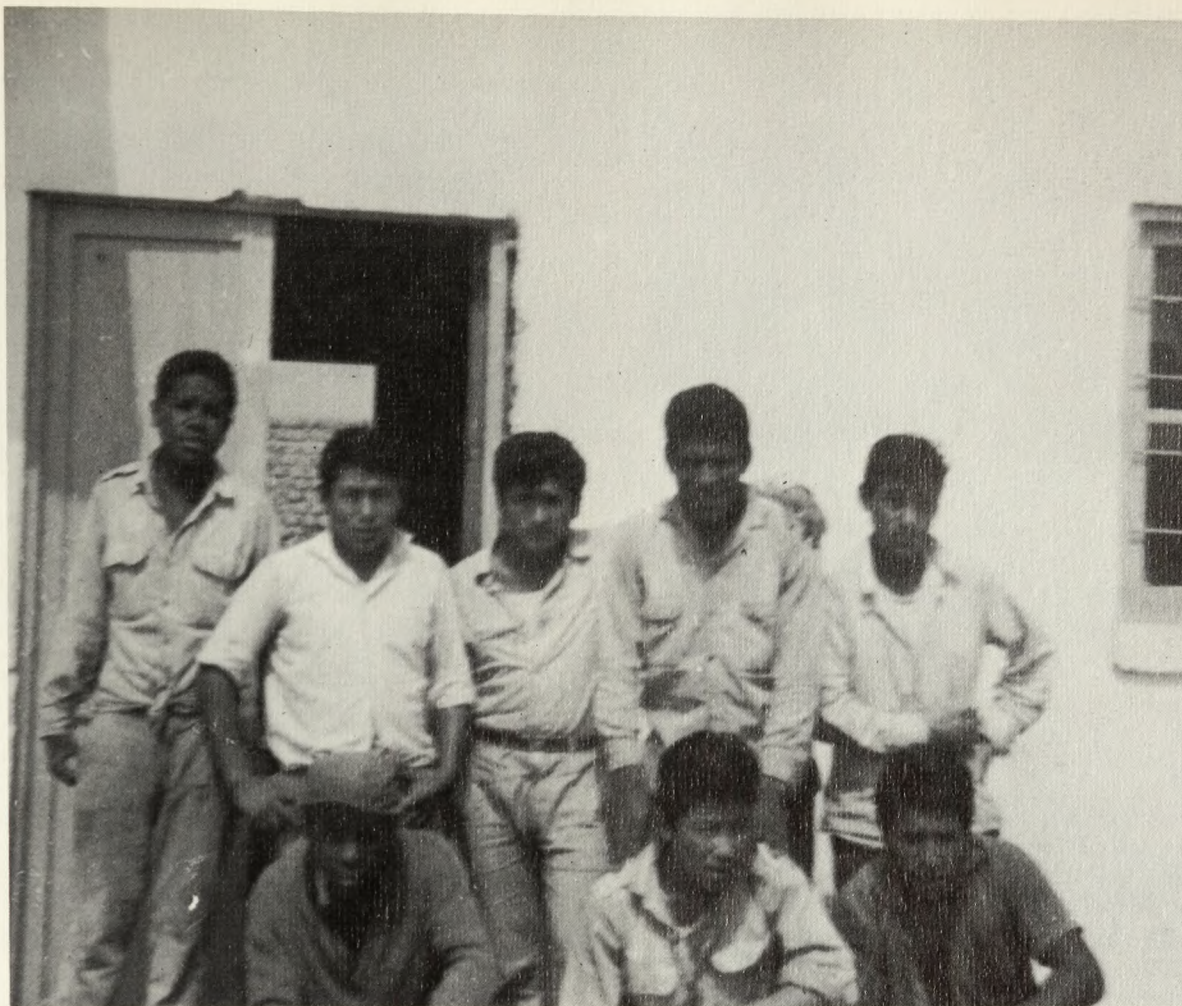
The members of the Board of Governors of the Ciudad.