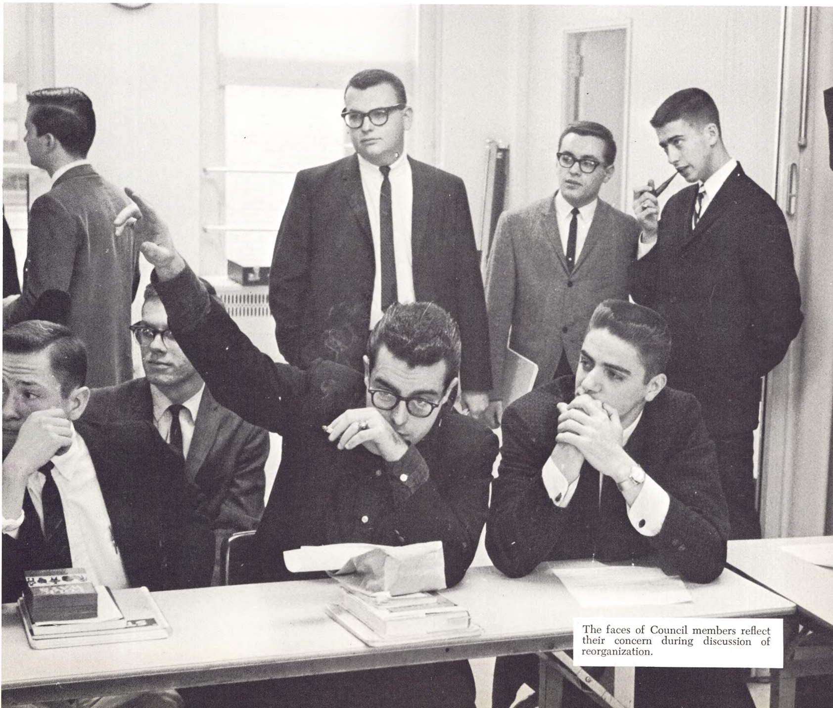
The faces of Council members reflect their concern during discussion of reorganization.