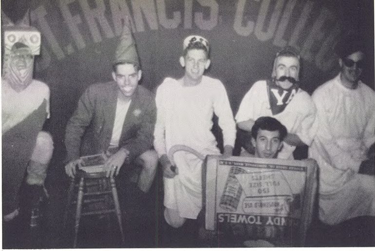
"Hell night comes but once a year but when it comes, look out!"