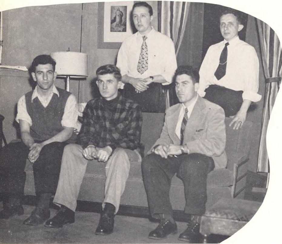
The hard-working stage crew takes a break after a performance of "Shadow".