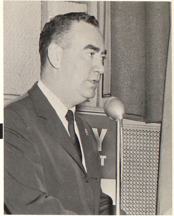
THE DEMOCRATIC CANDIDATE FOR CONGRESS , Hugh Carey, presented a winning platform before the students and the people of New York State. The symposium is held annually in the Lounge.