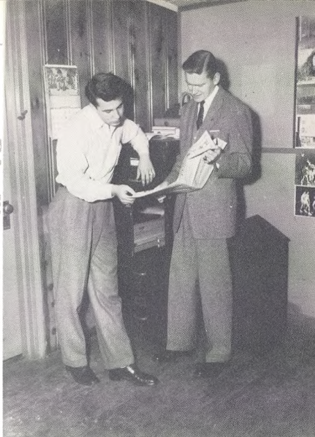
"From the Press Box."