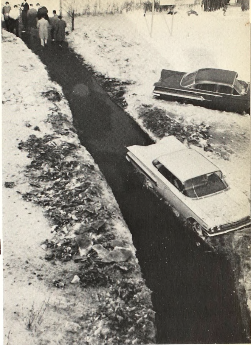
SNOW IN THE CITY doesn't stay white long. The path through the yard between the back door of the Lounge and Baltic Street is well used by students coming to and from classes.