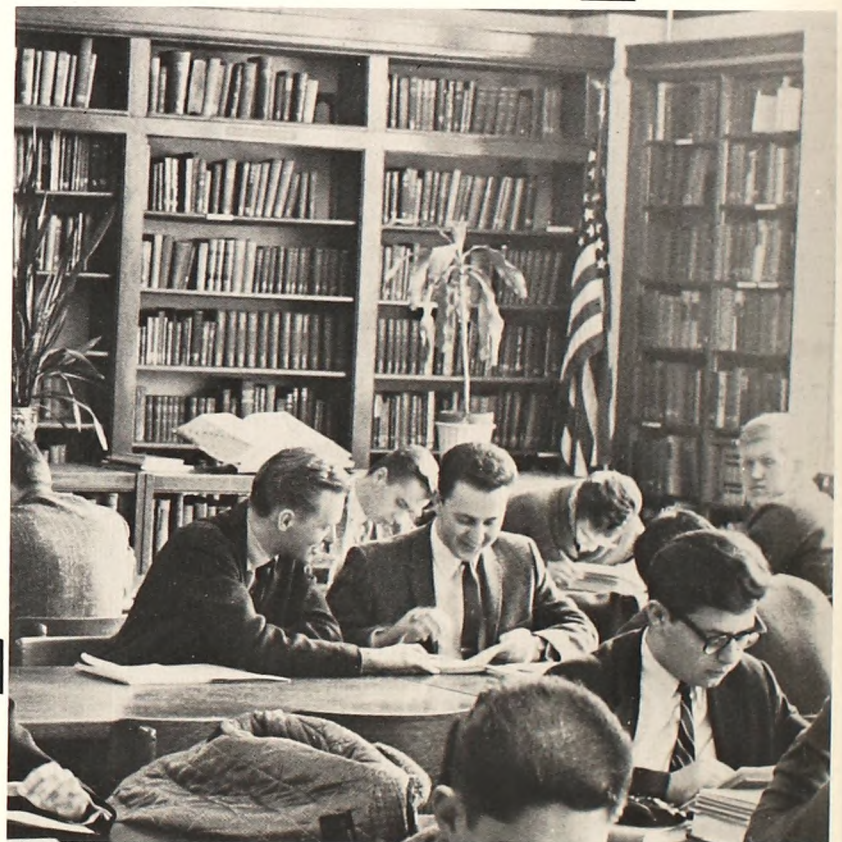
AN EVERYDAY SCENE IN THE LIBRARY finds some students deeply engrossed in study, others chuckling over a ridiculous math answer, and one staring at the camera. There's a ham in every crowd.