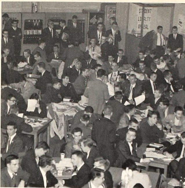
THE MID-DAY BUZZ . . . The Monsignor Kelly Lounge is the center of all social activity at the college. Here, students become better acquainted with one another; eating, studying, campaigning, rallying and the ever-popular "bull-session" in the Lounge were recurrent parts of the student's daily life.