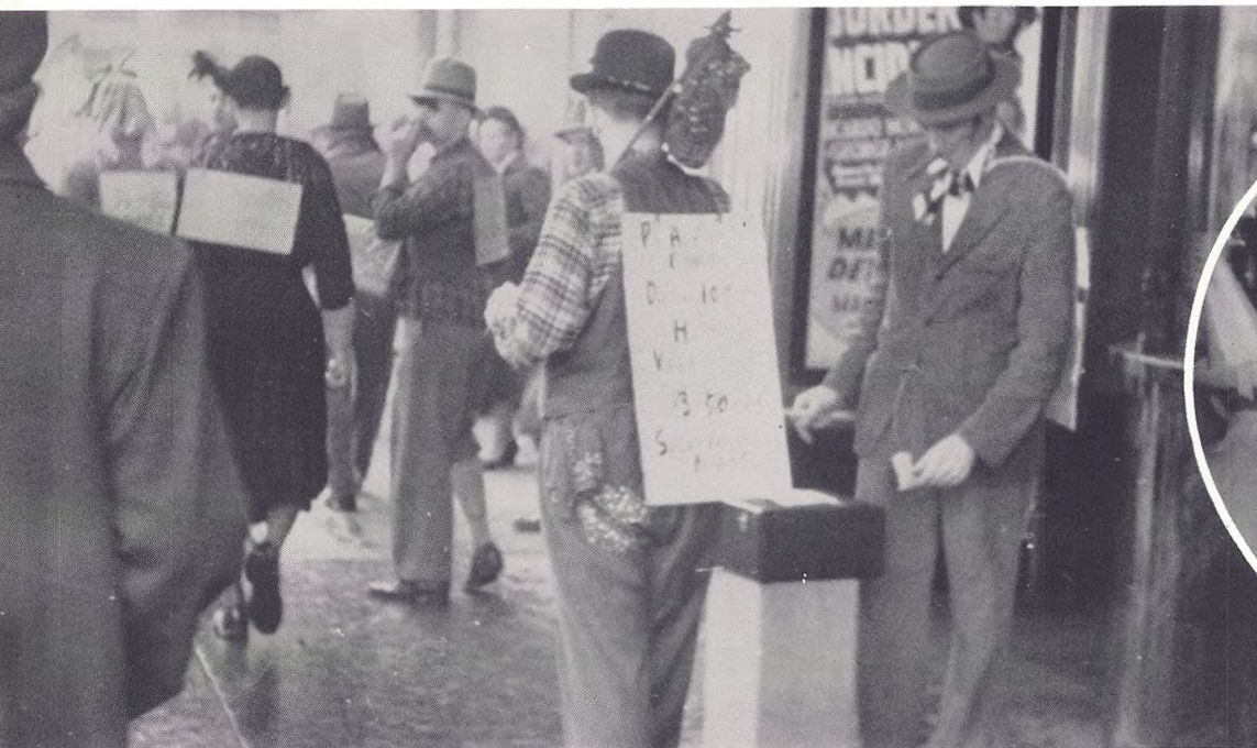
Pi Alpha dogs create mayhem at Boro Hall.