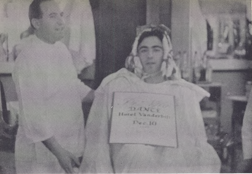
Question: "Which one is the Dot?"