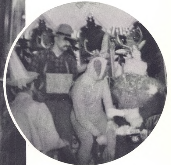
A & S Santa Claus gets into the act.